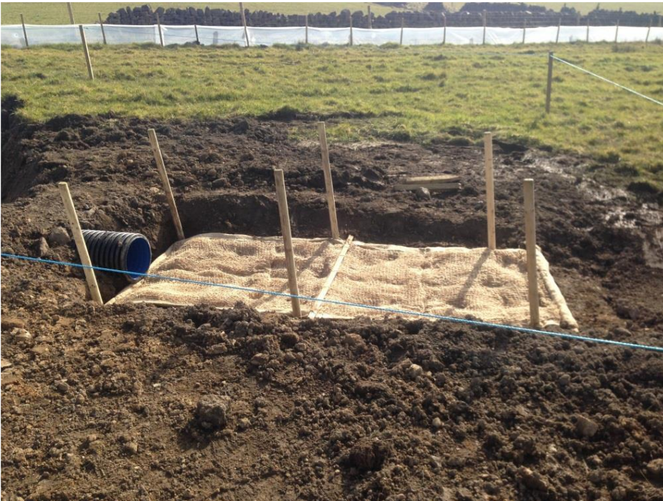
Plate 3: Typical silt mat to be placed at lagoon outfalls